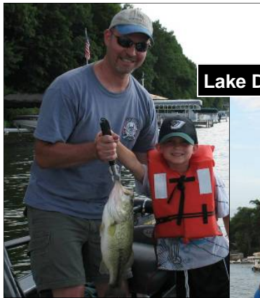
Lake Delavan in June & July